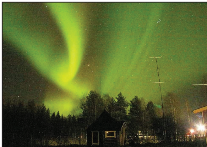
Photo A: So beautiful – it's definitely something nice to look at during any radio blackouts.

“Good openings with Oceania and Asia at different times of the day, NA always present at night via Aurora-E, unfortu-