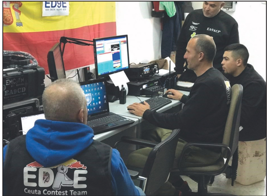
The ED9E team was 2 nd in Multi-Single Low Power.

The 26 th CQ WPX RTTY Contest will be held on 8-9 February 2020. I look forward to seeing everyone again then!